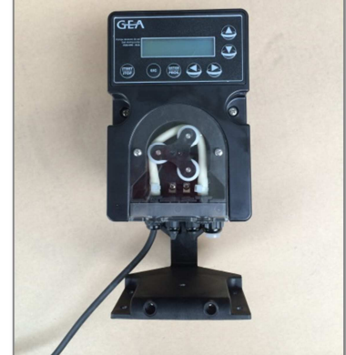
New pump version code 02933070