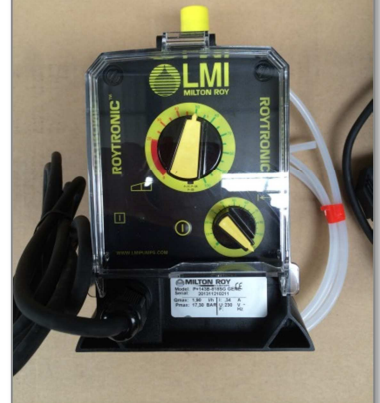
Old salt dosing pump version 02933053

Precision of the new pump is better than the old one and will be around 0,002 liters per hour, setting is also very easy and will require less than one minute.